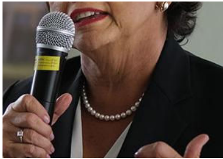
Lou Leon Guerrero

“We continue to face a labor shortage even as the demand for construction projects continues to rise. I am pleased that the prevailing wage rates were approved for common construction jobs,” Gov. Lou Leon Guerrero stated. “We have placed more than 1,000 people in skilled apprenticeship and pre-apprenticeship programs since the start of this administration, because we know that skilled labor is a passport to economic success for Guam working families.”