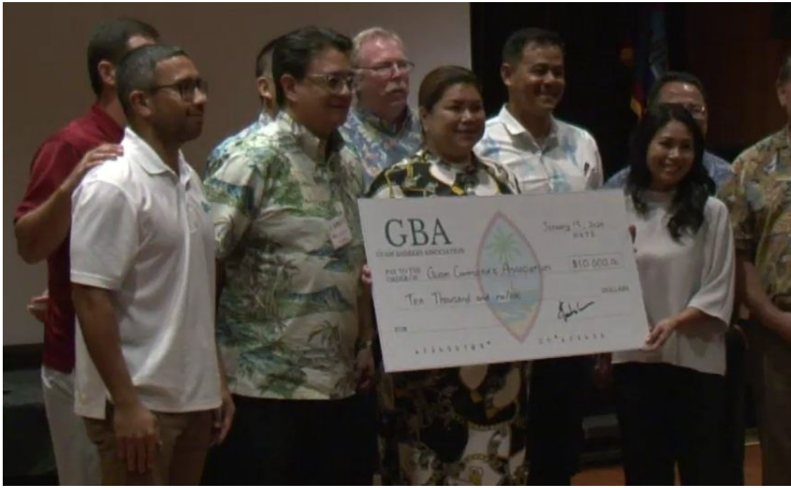
The check presentation took place at the Westin Resort.

The Guam Bankers Association made a $10,000 contribution to the Guam Contractors Association today to help cover the costs of the GCA's lawsuit against the U.S. Immigration Service.