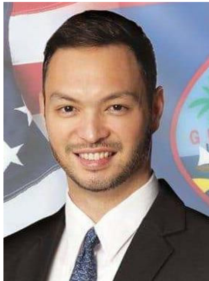
Michael San Nicolas